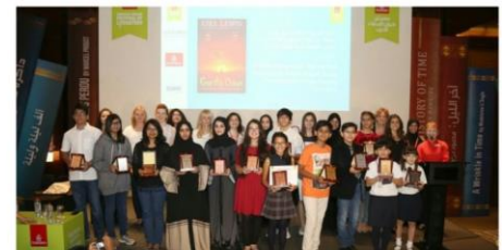
Young Writers Shine in 2016 Year of Reading

Young Writers Shine in 2016 #YearofReading - Congratulations to all the @OUPELTGlobal winners! #EAFOL16 http://ow.ly/Znnwk